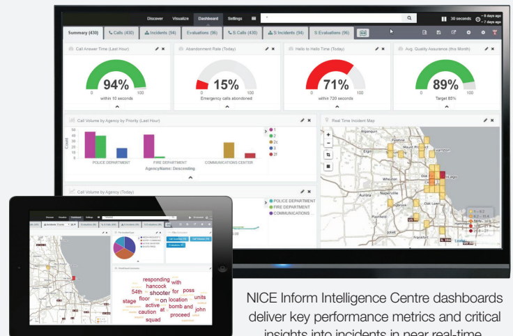
NICE Inform Intelligence Centre dashboards deliver key performance metrics and critical insights into incidents in near real-time.