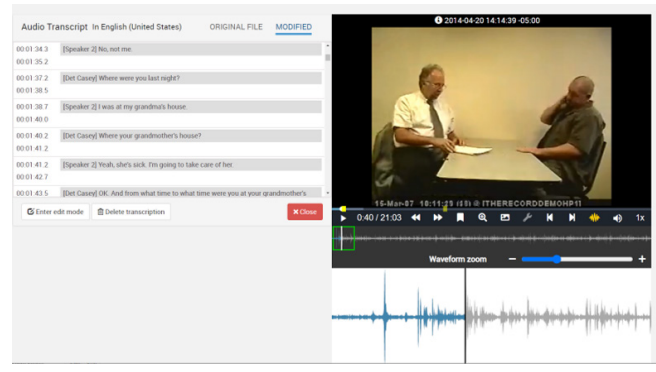
NICE Investigate can automatically transcribe video visits, phone calls, and 911 call audio